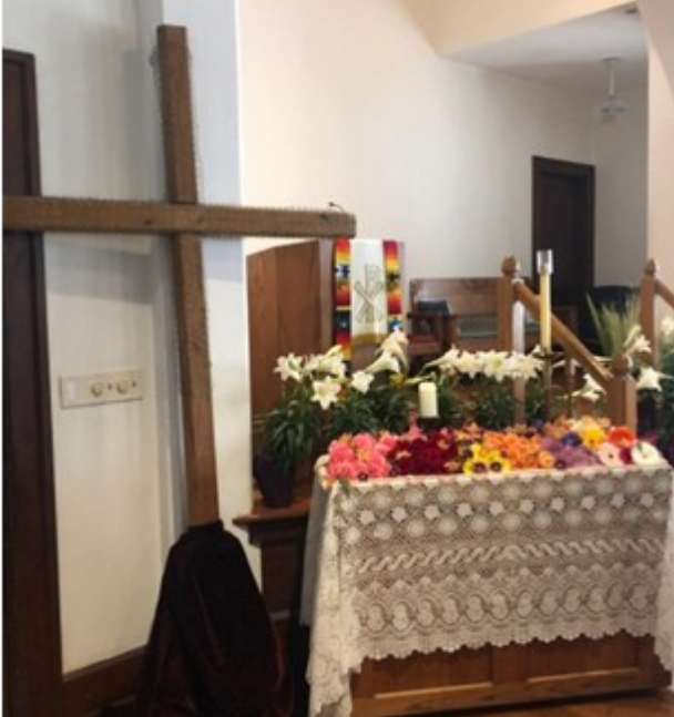
4/21/19 The bare unflowered cross before the service on Easter Sunday