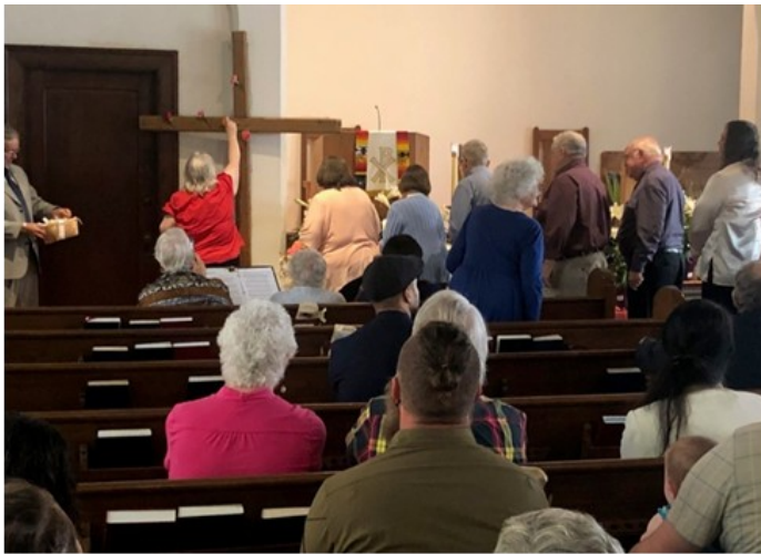
4/21/19 The flowering of the cross begins